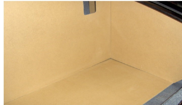
Note how the panels fit when the panel is in the right place of the trunk lip. See arrow.