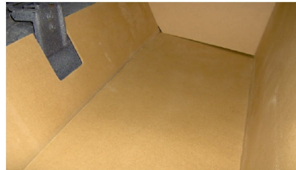
There may be enough clearance on the panels and will fill in once all the upholstery is in place. You may need to sand to fit precisely.