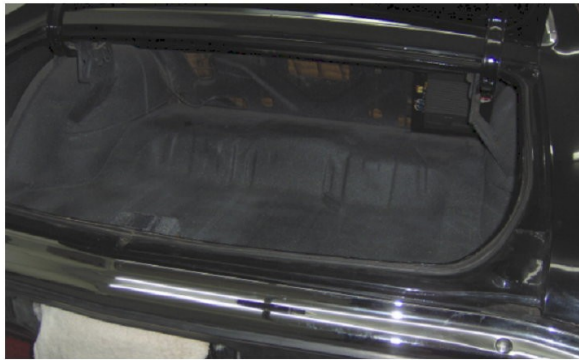
The Chevelle trunk for the trunk panel kit. You can leave the hold down bracket in place if you want. This trunk had it left in place.

This is a picture of the bottom floor panel and two side panels for the Chevelle. There are 5 pieces to this kit. The one piece that is optional is the smallest piece in the kit and it fits up against the back wall of the trunk. You can use it or you can carpet up the back without using this 5 th piece, it's your option. I suggest that a piece of carpeting material is put down first and glued across the back of the trunk, near the trunk latch, this is only a suggestion, then put the panel down as directed. The panel is big and needs to be placed in the trunk right side first. Set the panel on the floor of the trunk then slide it back toward the rear of the trunk.