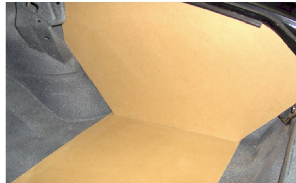
Do the same exact setup on the right side panel.