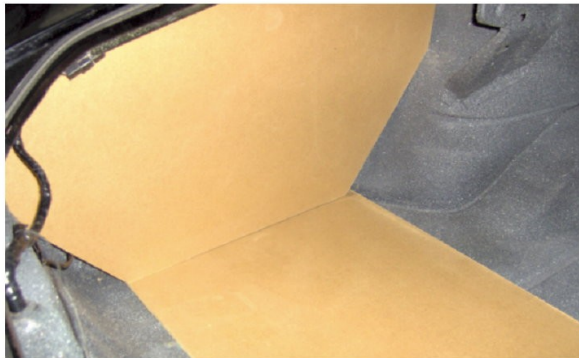
The left side is next and should be snug against the rear tail light housing area. The top of the panel should be inside the the trunk lip.