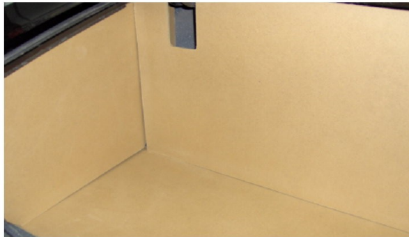
The next panel in is the back panel with the notchs for the hinges. Tilt the panel toward the back and then tilt into place under each hinge.

This is the next to last panel to go in. It's the back panel with the cutout for the hinges. Put it into the trunk by tilting the top toward the trunk latch and then slide it up and into place. It may get tricky here trying to keep the sides in place and getting the back panel where it belongs. The last panel fits against the rear of the trunk under the latch. The panels fit much tighter with material on them and will not move once set into place. Please Note: Adjustments to the panels fit can be made with a rasp or a orbital sander using 80 grit sanding paper.