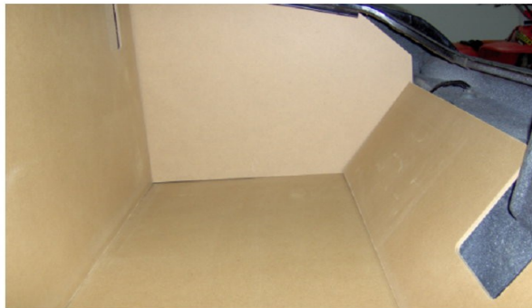
The last panel is the rear panel that fits under the trunk latch hold down. The panels may need to be sanded down if using thick material.